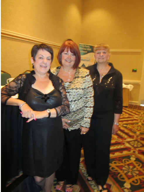
Waiting for the Friday evening banquet to begin.